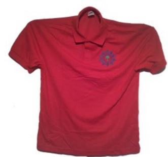
Year 6 polo shirt in red

Please label all clothing with your child's name.