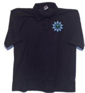
Year 6 polo shirt in black