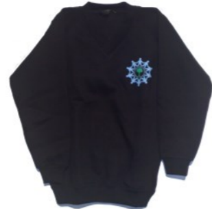
School sweatshirt in navy