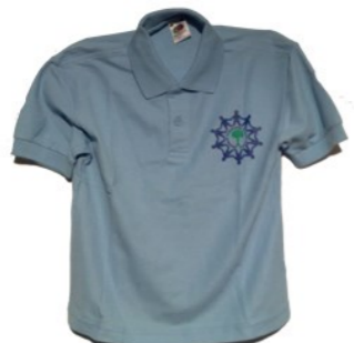
Reception to year 5 polo shirt in light blue or white